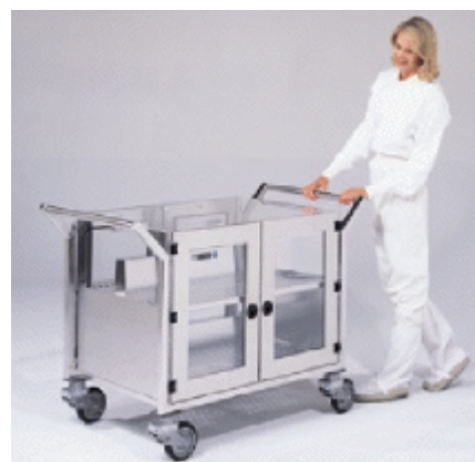
Cushioned ride for optimal product protection

Perforated shelves ensure uniform gas distribution. Their angled design keeps boxes securely in position during transit. 304 stainless steel door frames ensure tight seals and a long service life. Overall