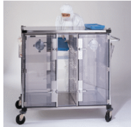
Shown with optional hygrometer and acrylic shelves.

This versatile DesiCart a provides dual storage chambers, each 16.5"W x 24"D x 37.75"H (clearance: 16"W x 24"D x 36.25"H). Chrome-plated racks allow placement of adjustable acrylic shelves. In addition, a 10"W x 24"D x 37.75"H kitting area, located between the storage chambers, allows convenient placement of kitting trays on adjustable acrylic shelves. Five-inch casters allow smooth rolling over a variety of floor surfaces.